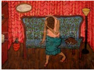
Amy Charmatz - Woman on Couch