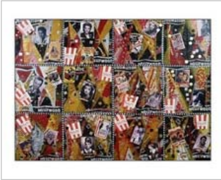
Senior group project (Generations Division) - Hooray for Hollywood